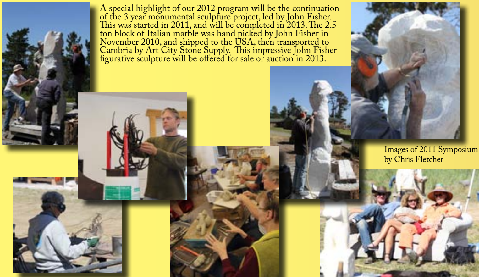
Images of 2011 Symposium